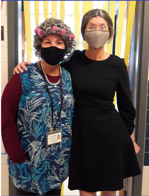
Pictured above and below (top row): Smith Road Elementary School pictures celebrating 100 Days of School.

We would love to share your photos of at home school environments. If you're willing to share, please send your high quality images using the link below. We'll be using your photos in this newsletter and other publications throughout the school year. Additionally, high resolution, horizontal photos will be considered for the District website. If you'd like to share pictures, please click here to upload them to our communication office staff.