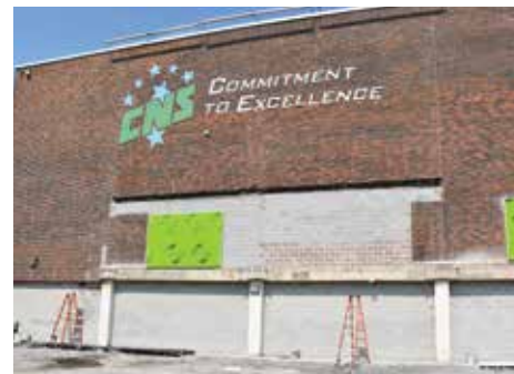
Construction projects involving the new community pool are ongoing.