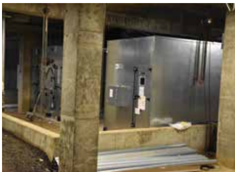
New HVAC systems will dramatically improve comfort, air quality and efficiency for students and staff at CNS High School.

Phase two work, which includes renovations to the auditorium, gym, and locker rooms, is about half-way completed and it is anticipated that we will be opening the newly renovated Main Gym for limited after school use before the Christmas holiday. Completion of this work supports work associated with the pool addition. A ground-breaking ceremony was held on Oct. 30 to mark the official start of the pool's construction.