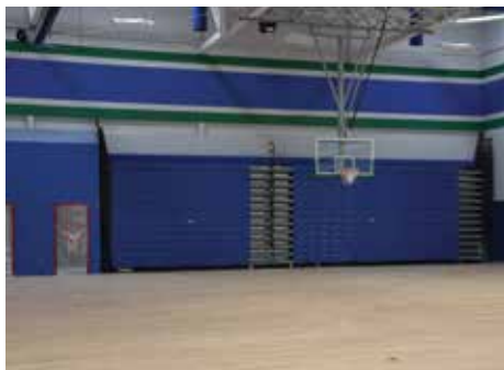
The main gymnasium at CNS High School is almost completely renovated and should be available for limited use before year end.